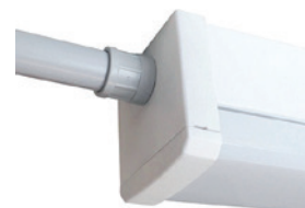
20mm knockouts for conduit or Cable Glands