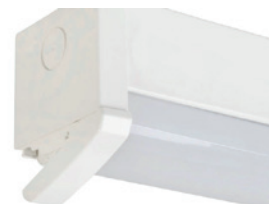
Captive end caps